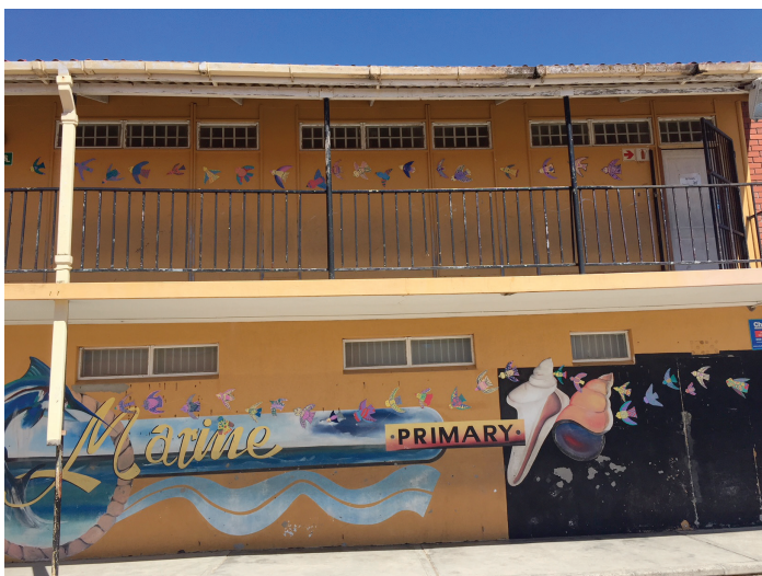
320 painted birds were installed at Marine Primary. The birds filled the corridors and were incorporated into the existing mural.