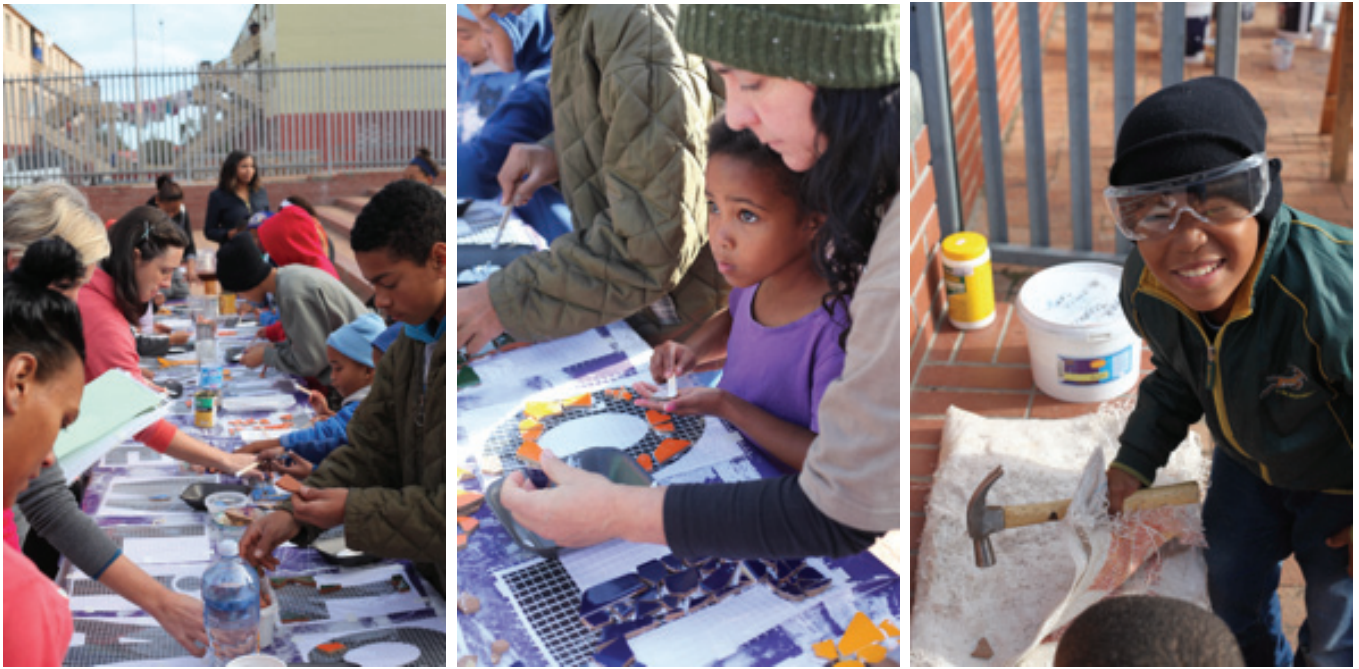
Practical mosaic workshop with the support from volunteers and teachers. The end result was a new sign for the Ocean View Library entrance.