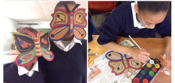
Painted butterfly masks using watercolour and learning about the Principles of Design.