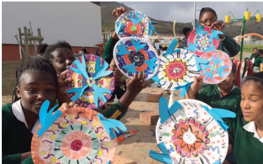
Learners from Kleinberg and Marine Primary created colourful mandala designs for the library exhibition.